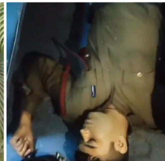
was sleeping on an upper

berth, also sustained injuries in his abdomen, he said. The duo was shifted to a private hospital, where the constable succumbed to injuries, he said. The deceased jawan was a resident of Rajasthan, the official said, adding that investigation into the matter was underway.